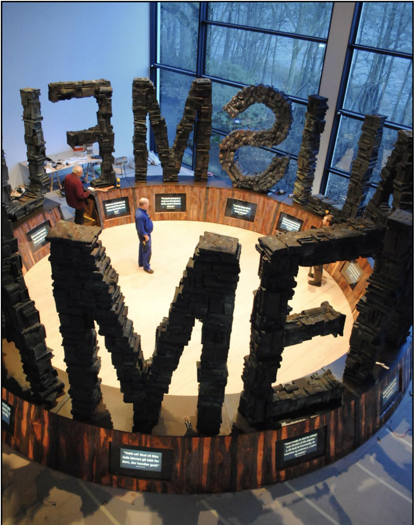
Inside: 600 of the darkest and brightest quotations from the Torah, the Bible and the Quran.

An art installation by Jens Galschiøt about religious fundamentalism and monotheistic dogmas.