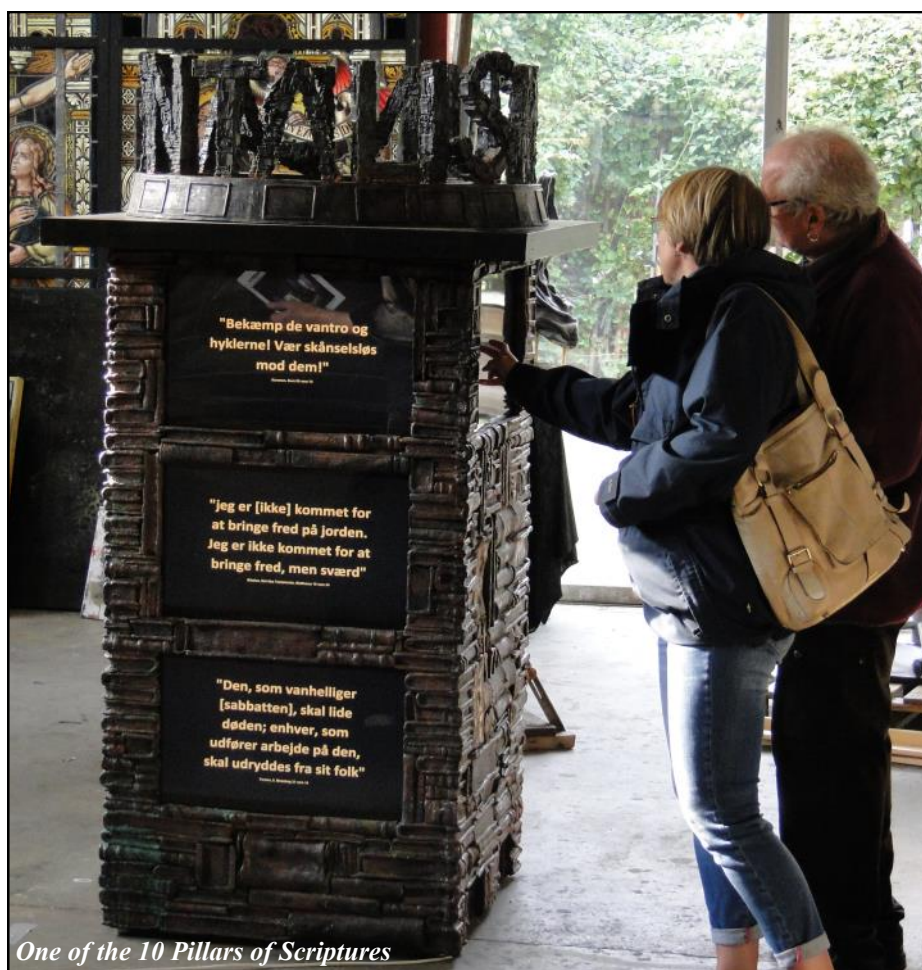
One of the 10 Pillars of Scriptures

The Pillars of Scripture are exhibited at museums, libraries, places of education, malls, etc. to initiate the dialogue.